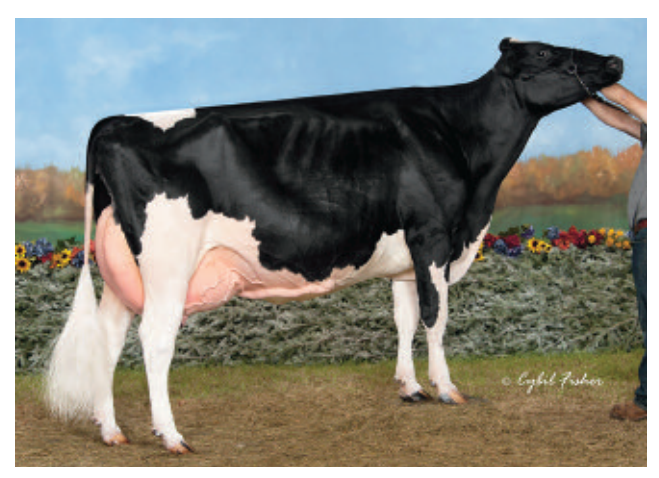
Rayon D'Or Goldwyn Adonial, EX-94 2*, was nominated Tout-Québec Five-Year-Old in 2013, has earned two Superior Lactation awards, and is the dam of 21 daughters classified 86 per cent VG or better.