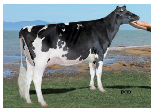
Wabash-Way Shottle Ember, VG-88 3*, produced over 40 000 kg of milk in two lactations and has an LPI of 2650. She is not only dam to 15 daughters classified 93 per cent GP or better, she is also the dam of the bull Rayon D'Or Eternel , offered by Bull D'Or génétique inc.