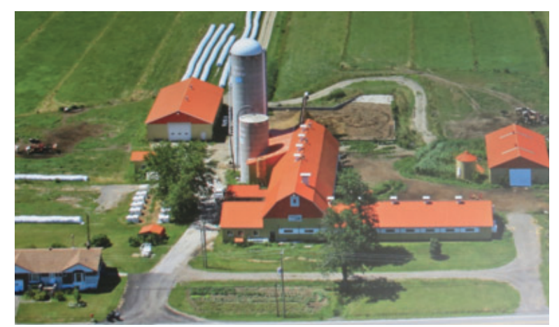
The modern facilities at Ferme Forest.

acknowledges that he tended to focus more on conformation, and may have neglected health traits. As for fertility, a score of 100 appears to be the minimum.