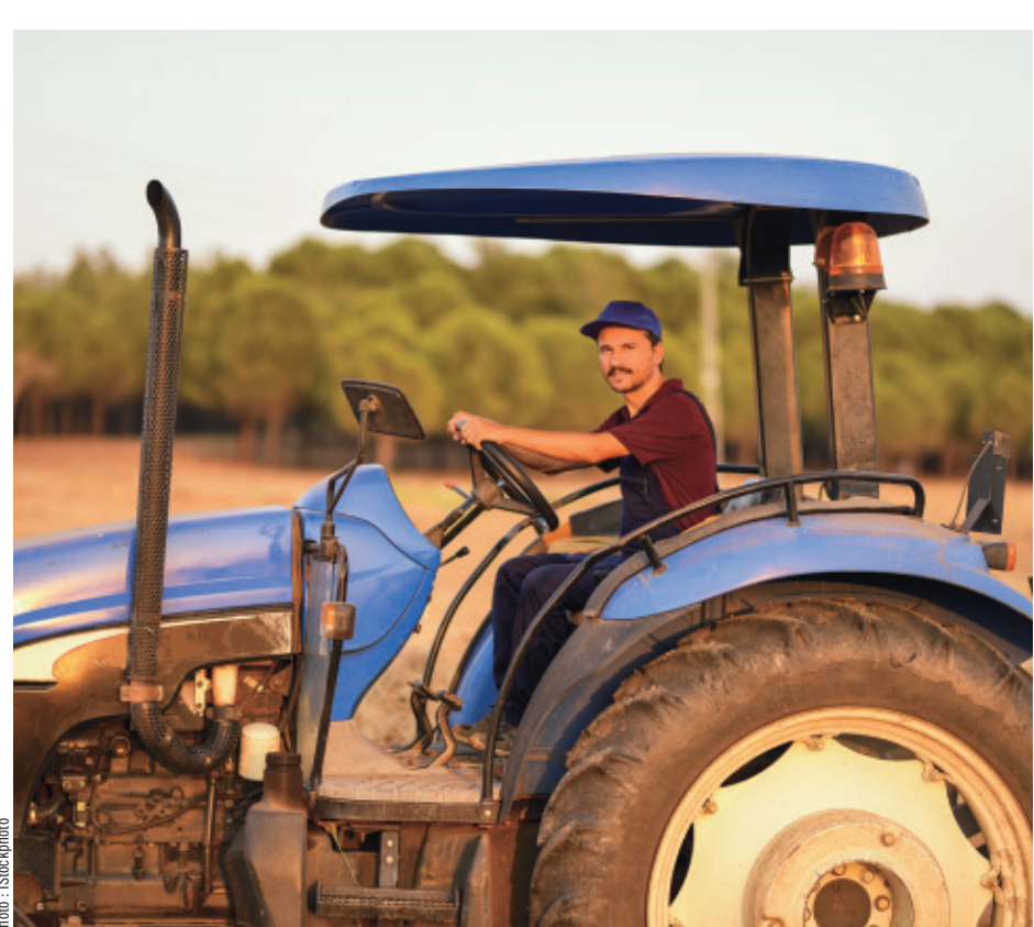
Foreign workers can also work in the fields.