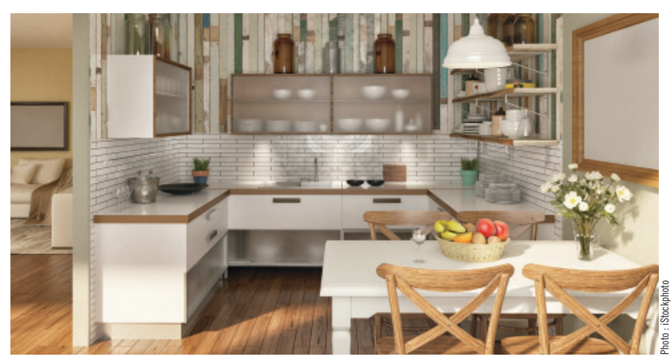
Comfortable and affordable housing must be provided to temporary foreign workers.

Foreign workers are understandably given access to job postings that have first been offered to Canadians, but for which the latter have shown no interest. Before getting authorization to hire TFWs, employers must provide proof that they have indeed advertised the job. To do that, a job posting that meets advertising requirements, defining the duties and wage associated with the job, must be posted for a minimum of 14 days, and during the three-month period prior to the employer applying for a Labour Market Impact