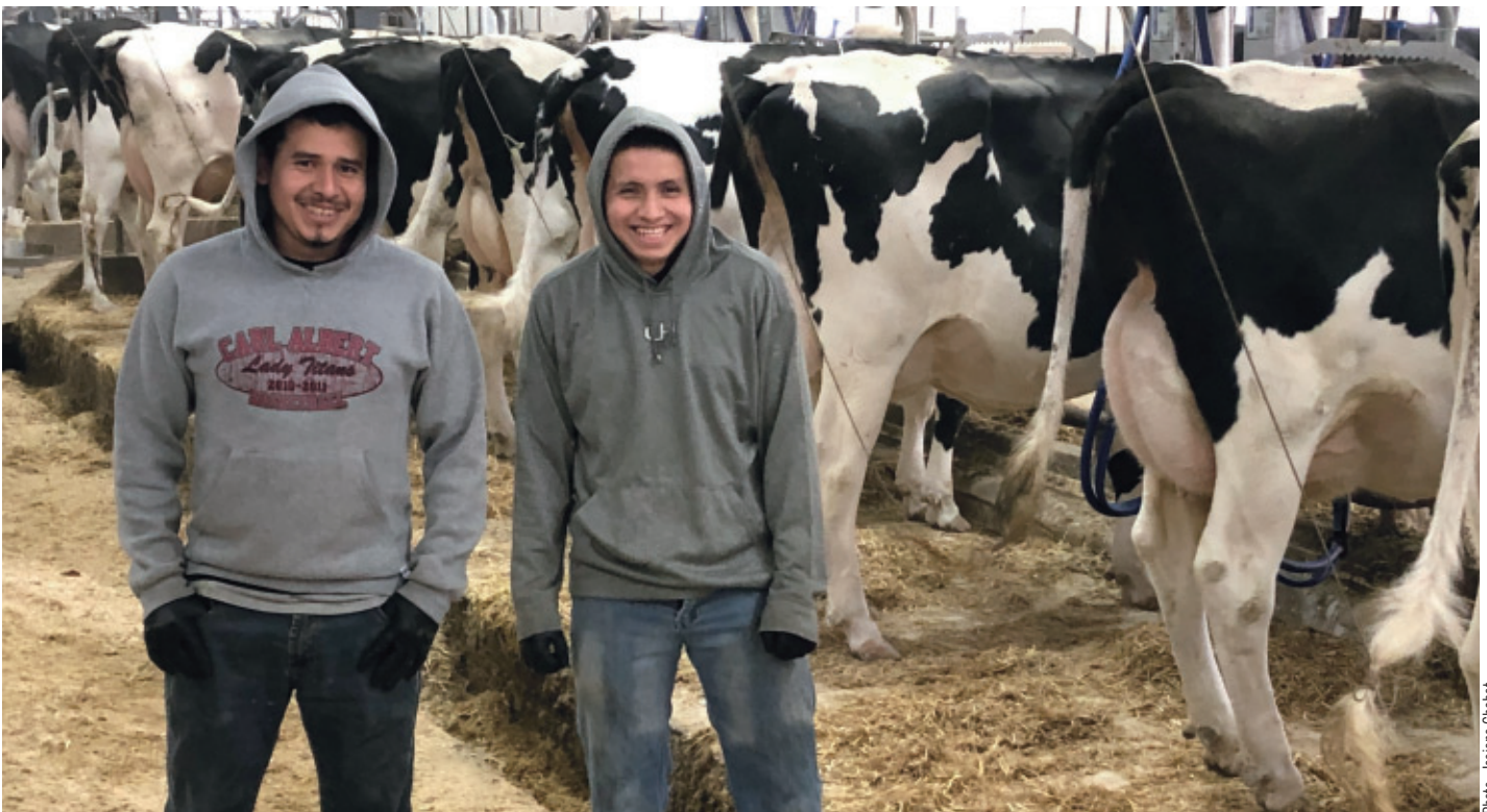
Increasingly, dairy producers are choosing to hire foreign workers to maintain the productivity of their operations.

Lastly, it is important to note that under the Immigration and Refugee Protection Act (IRPA), TFWs are hired by the employee specified in the application. Transferring or sharing TFWs among employers is therefore prohibited without prior authorization. Under certain conditions, however, an application for an employee transfer can be made by a farm. 🔶