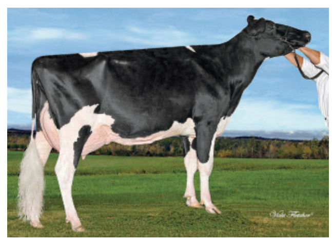
Forest Goldwyn Winnie Dawn, EX 1*, first Four-Year-Old at the Rive-Nord show in 2011, is the dam of six daughters, which include two VG and three GP.