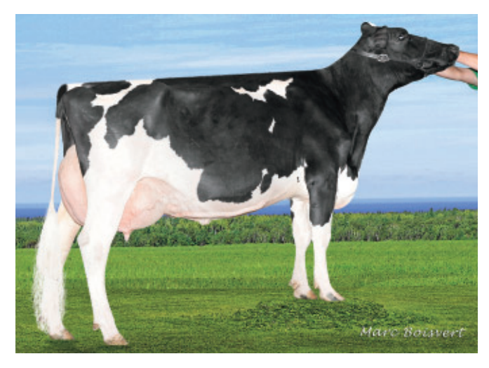
Now in her seventh lactation, Lanaudoise Denison Arlene, EX 2E, has already produced 87 471 kg of milk. She is the dam of nine daughters, classified 1EX, 5 VG and 3 GP.

The same principle holds for feeding as well. Since 1997, the cows have been fed a TMR composed of corn silage and alfalfa silage in equal parts, in addition to high-moisture corn and a supplement.