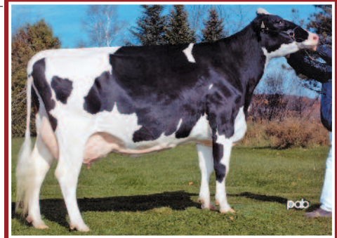
Comestar Igniter Loriana VG-86 18*

HOCANF107439841 B&W ET B:22 Mar 2012 GP-84-2YR-CAN 02-00 305 10416 316 3.0 313 3.0 03-02 P66 12296 361 2.9 337 2.7 PBCA 277 219 236 2 LACT: 16255 500 3.1 489 3.0 KG Avg BCA: M277 F219 P236 2ND JR. 1-YR GLENGARRY 2013 2ND JR. CALF PRESCOTT 2012 3RD JR. CALF GLENGARRY 2012 3RD JR. CALF PONTIAC 2012 Progeny Data: 0EX 0VG 1GP 0G 0F 1 DAUS ME AVG: 16091 597 3.7 480 3.0 AVG BCA: M304 F306 P290