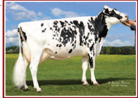
Liddlehome-R Shottle EX-94 3E

HOUSAF71875307 B&W ET B:10 Jun 2013 VG-85-2YR-CAN 2*(3/7) 02-02 305 8230 372 4.5 301 3.7 BCA 204 246 233 03-09 305 9728 459 4.7 353 3.6 365 11066 534 4.8 409 3.7 BCA 204 261 234 2 LACT: 23969 1143 4.8 894 3.7 KG Avg BCA: M204(-3) F254(32) P234(16) 2ND SUM.1-YR RIVE-NORD EXPOSITION 2014 Progeny Data: 0EX 4VG 1GP 0G 0F 5 DAUS ME AVG: 12703 547 4.3 437 3.4 AVG BCA: M240 F280 P264