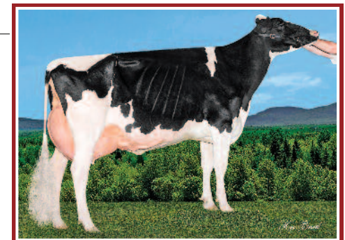
Belle-Riviere Magneti Virginia EX-95 4E 1 st 5-Yr-Old Bécancour 2018 1 st 5-Yr-Old Sorel 2018 Mère I Dam

BELLE-RIVIERE LEO VALENTINE EX-CAN 2* BELLE-RIVIERE SKYCHIEF FRANCE EX3E-CAN 9* BELLE-RIVIERE LEADMAN JASMINE VG-86-5YR-CAN 12* ROB MARANN JACINTHE GP-82-3YR-CAN 1* REGANCREST BOARD CHAIRMAN BEA EX-90-6YR-USA REGANCREST APACHE STANDOUT BEA VG-86-7YR-USA REGANCREST STANDOUT BERTRAND VG-85-USA