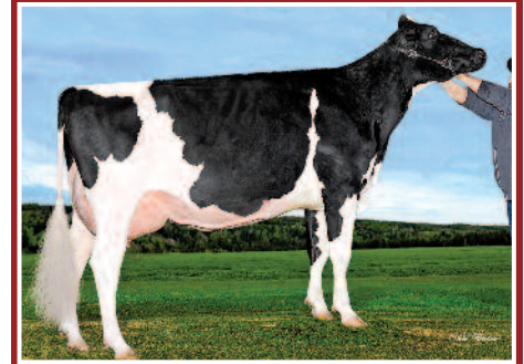
Rubis Goldwyn Royal VG-87 (MS:88) 2-10 365 12,456 kg 4.4% 3.6% (254-293-273) En vente | She sells