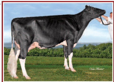
Gilnor Mianilie Jasper EX-93 2E 1* Mère | Dam