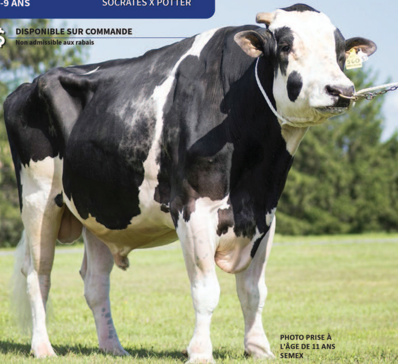
PHOTO PRISE À L'ÂGE DE 11 ANS SEMEX