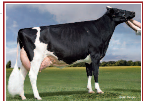
Long-Haven Gold Rochelle EX-92 9*

HOUSAF70476983 B&W ET B:13 Oct 2010 VG-89-4YR-CAN 3*(3/13) 01-11 305 8996 390 4.3 290 3.2 BCA 232 269 234 03-05 305 14292 545 3.8 446 3.1 365 16181 631 3.9 516 3.2 BCA 303 315 299 04-10 305 13974 486 3.5 426 3.1 BCA 274 253 261 3 LACT: 47092 1865 4.0 1528 3.2 KG Avg BCA: M270(50) F279(34) P265(36) 1 Superior Lactations Progeny Data: 0EX 6VG 3GP 1G 0F 10 DAUS ME AVG: 12386 474 3.8 397 3.2 AVG BCA: M234 F243 P240